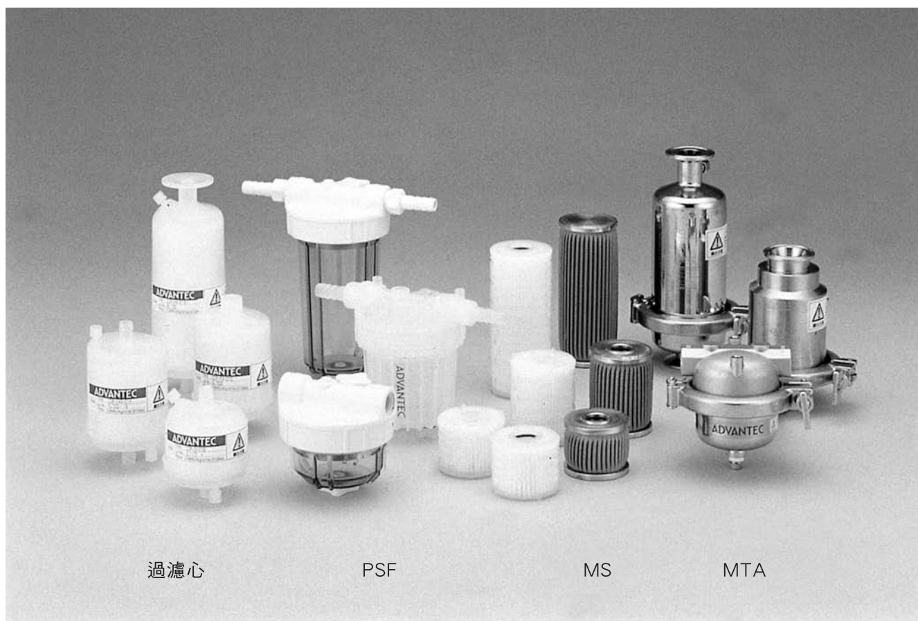
過濾心 PSF MS MTA